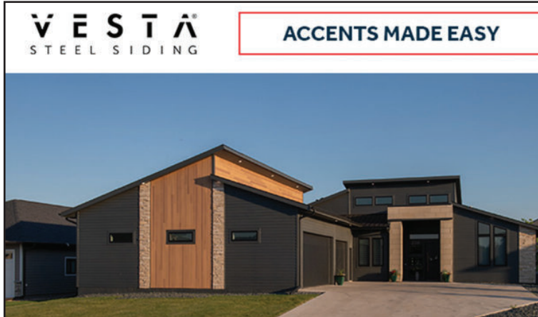
Colors shown: Diamond Kote Graphite Lap Siding with RigidStack™ & Vesta Steel Siding Gilded Grain

Please contact a Mead sales associate for additional information and availability of these new items.