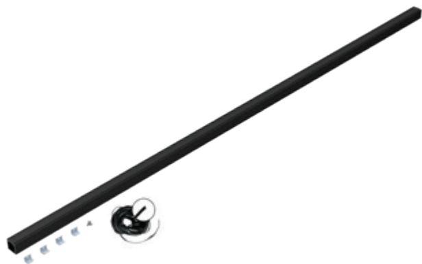
SCREEN POST KIT