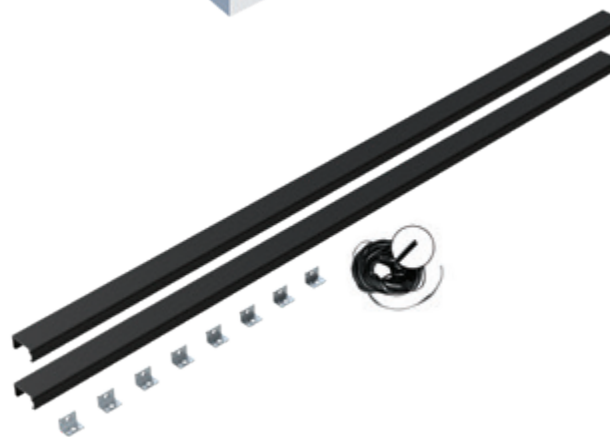
PERIMETER CHANNEL KIT