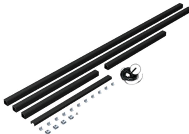
SCREEN DOOR FRAME KIT